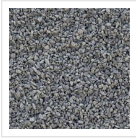
Slag 30 Perlite Ore