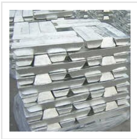
Industrial Magnesium Ingots