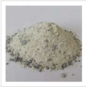
Basic Ramming Mass