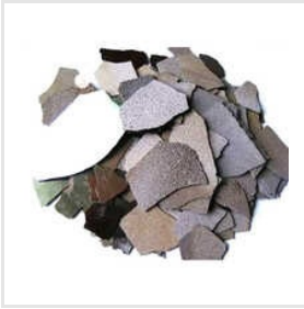
Industrial Manganese Metal Flakes