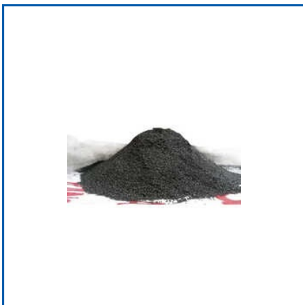
FOUNDRY FLUXES CHEMICAL

50 kg Calcined Petroleum Coke, Aluminium Cubes, Aluminium Notch Bar, Aluminum Shot, Anti Piping Compound, Basic Ramming Mass, Boric Acid Powder, Ferro Alloys Lumps, Ferro Silicon Lumps, Foundry Fluxes Chemical, High Alumina Ramming Mass, Induction Furnace Ramming Mass, Industrial Magnesium Ingots, Industrial Manganese Metal Flakes, LC Ferro Chrome Lumps, etc.