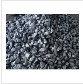
Ferro Alloys Lumps