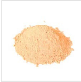
Induction Furnace Ramming Mass