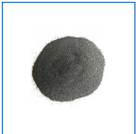
ANTI PIPING COMPOUND