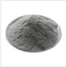
Induction Furnace Ramming Mass