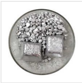
Aluminium Notch Bar