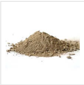
Neutral Ramming Mass