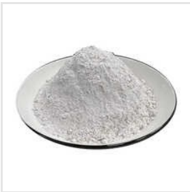
High Alumina Ramming Mass