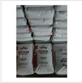
Unexpanded Foundry Grade Perlite Ore