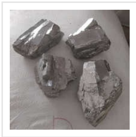
LC Ferro Chrome Lumps