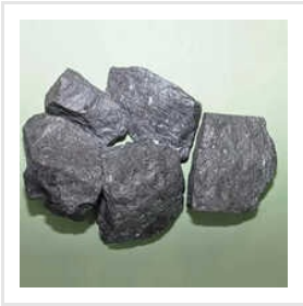
Ferro Silicon Lumps