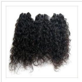
Vintage Virgin Curly Unprocessed Hair