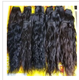
Remy Virgin Brazilian Unprocessed Indian