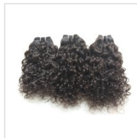
Virgin Human Hair Tangle Free Silky And