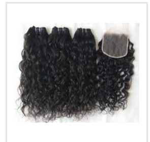
Natural Raw Unprocessed Virgin