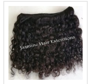
Cuticle Aligned Deep Curly Peruvian Human