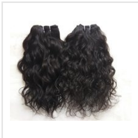
100% Virgin Human Hair Raw Remy Natural