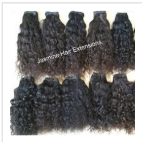
Top Quality Virgin Human Hair