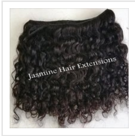
Natural Black Color Deep Curly Human Hair