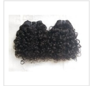
Natural Black Virgin Curly Human Hair