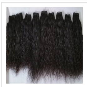
Unprocessed Natural Curly Hair