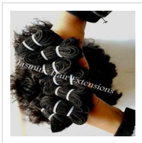
Curly Double Weft Human Hair