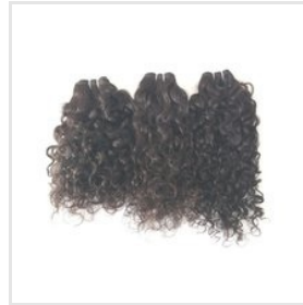
Natural Deep Curly Raw Indian Human