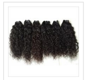
Raw Unprocessed Natural Curly Hair