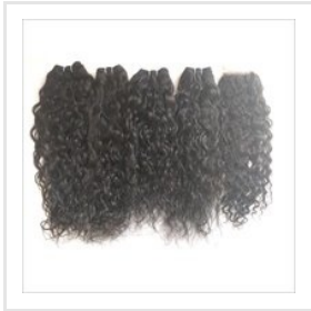
Wholesale Price Top Quality Virgin Human