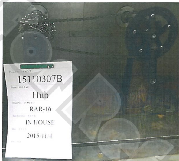
Fig. 2 Fatigue of hub