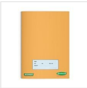
A5 Book R And B Gap 172 Pages