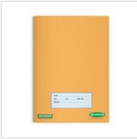
A5 Book Big Square 76 Pages