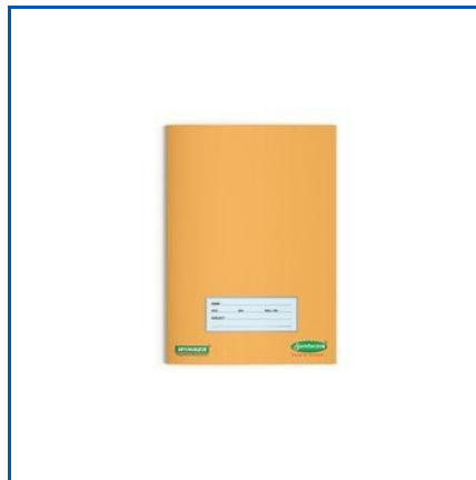
A5 BOOK UNRULLED 172 PAGES