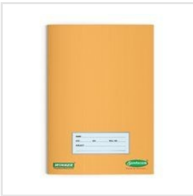
A5 Sketch Book R And B Gap 172 Pages