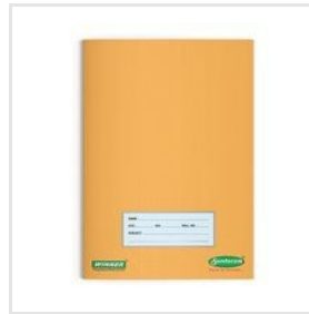
A5 Book Medium Square 172 Pages