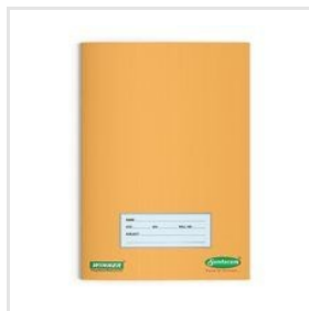
A5 Book Small Square 172 Pages