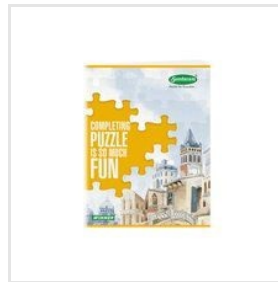
A5 Book Hard Bound 172 Pages