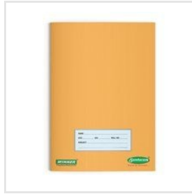
A5 Book Unrulled 76 Pages