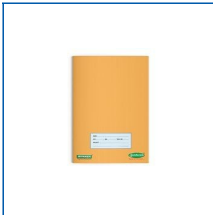
A5 BOOK MEDIUM SQUARE 76 PAGES

4 Pages Board Exam Paper, A4 Book - 172 Pages, A4 Book 280 Pages, A4 Book 386 Pages, A4 Book 76 Pages, A4 Book Hard Bound 240 Pages, A4 Book Unrulled 172 Pages, A4 Cartridge Drawing Paper 40 Pages, A4 Notebook, A5 Book 172 Pages, A5 Book 3 in 1, A5 Book Big Square 172 Pages, A5 Book Big Square 76 Pages, A5 Book Hard Bound 172 Pages, A5 Book Medium Square 172 Pages, etc.