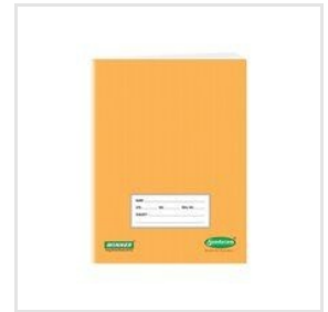
A5 Note Book Single Line