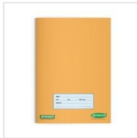
A5 Book Two Line 172 Pages