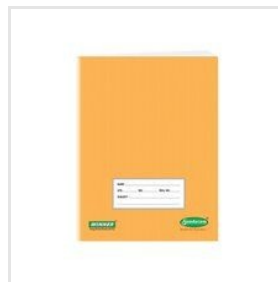
A5 Book 3 In 1