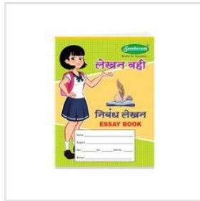
A5 Book 172 Pages