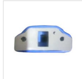
OT Light Spare Parts And Accessories