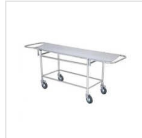
Patient Stretcher Trolley