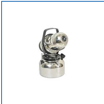
TABLE TOP FOGGER MACHINE