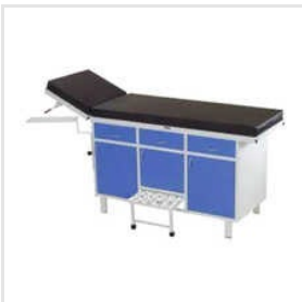
Examination Couch With Cabinet