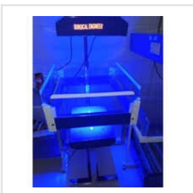
Phototherapy Machine Single