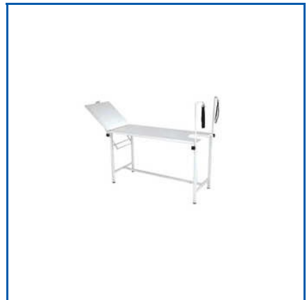
TWO FOLD EXAMINATION TABLE