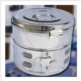
Stainless Steel Hospital Dressing Drum