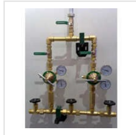
Hospital Oxygen Pipe Line