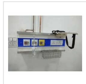
Oxygen Pipeline System