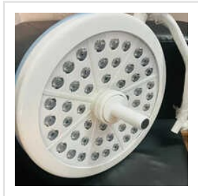
Led OT Light