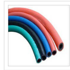
Industrial Rubber Hose Pipe