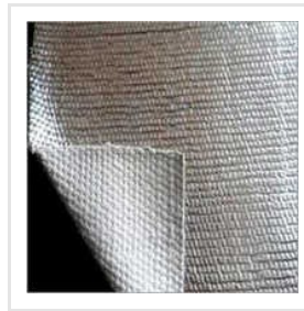
Asbestos And Non Asbestos Cloth