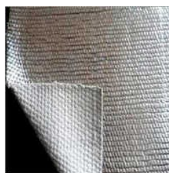
ASBESTOS AND NON ASBESTOS CLOTH