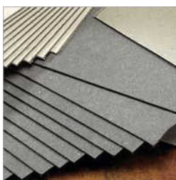
ASBESTOS AND NON ASBESTOS MILL BOARD

Asbestos and non Asbestos Cloth, Asbestos and non asbestos Mill Board, Asbestos and non asbestos Rope, Asbestos and none asbestos Tape, Industrial Mica Sheet, Industrial Rubber Hose Pipe, MS Bolt, MS Lancing Pipe, MS Nut, MS Oxygen Lancing Pipe, etc.