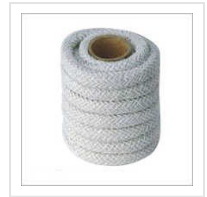
Asbestos And Non Asbestos Rope