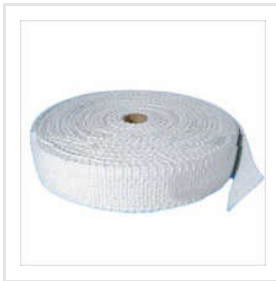
Asbestos And None Asbestos Tape