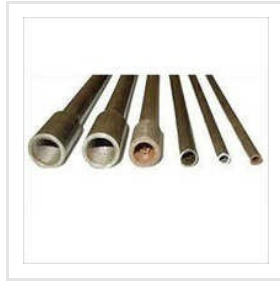
MS Oxygen Lancing Pipe