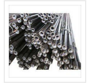
MS Lancing Pipe