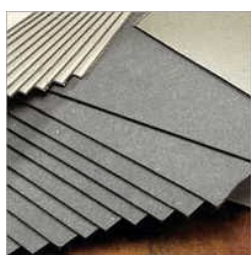
ASBESTOS AND NON ASBESTOS MILL BOARD

Asbestos and non Asbestos Cloth, Asbestos and non asbestos Mill Board, Asbestos and non asbestos Rope, Asbestos and none asbestos Tape, Industrial Mica Sheet, Industrial Rubber Hose Pipe, MS Bolt, MS Lancing Pipe, MS Nut, MS Oxygen Lancing Pipe, etc.