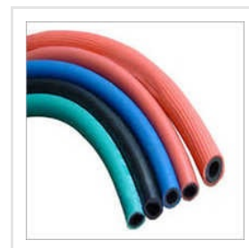
Industrial Rubber Hose Pipe