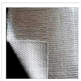
Asbestos And Non Asbestos Cloth