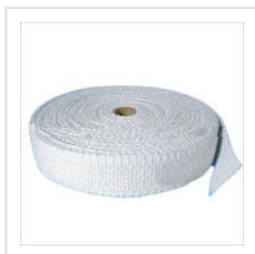
Asbestos And None Asbestos Tape