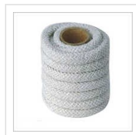
Asbestos And Non Asbestos Rope