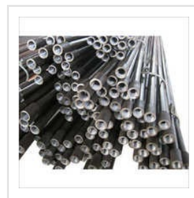
MS Lancing Pipe