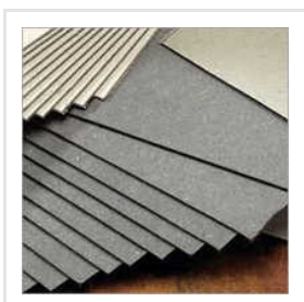
Asbestos And Non Asbestos Mill Board