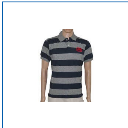
MENS STRIPED POLO T SHIRT