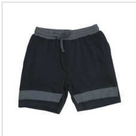
Mens French Terry Knit Shorts