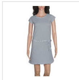
Ladies Forever Knit Short Dress