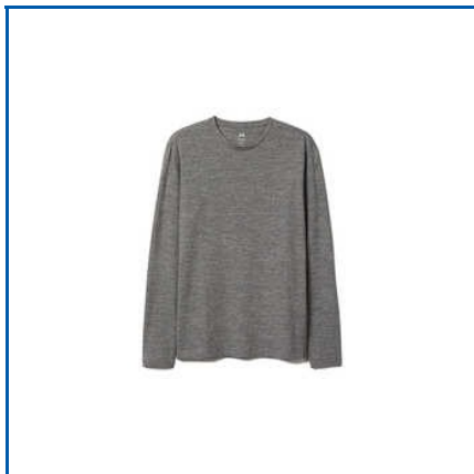
MENS SLIM FIT LONG SLEEVE T SHIRT

912M1Baby 3 Pack Long Sleeve Bodysuits, AE Mens Woven Boxer Shorts, Baby Boys Full Zipper Sweatshirt, Baby Boys Printed Pyjama Sets, Baby Boys T Shirt, Baby Girls 2 Pc Set, Baby Girls 2 Pc Set Long Top And Legging, Baby Girls AOP Knit Dress, Baby Girls Printed T Shirt, Baby Girls Sweat Pant, Baby Hats, Baby Interlock Bath Wraps, Baby L And S Printed Bodysuits, Baby Sleeveless Terry Playsuit, Baby Terry Sleepsuits, etc.