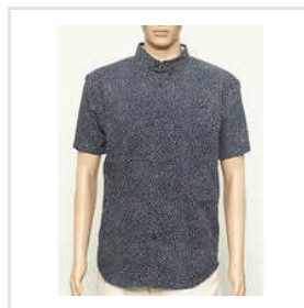
Mens Slim Fit Cotton Shirt