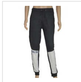
Mens French Black Terry Joggers