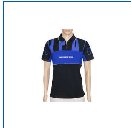
MENS CUT N SEW POLO T SHIRT