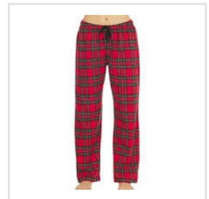
Ladies Flannel Lounge Pants