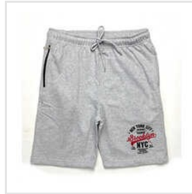
Mens French Terry Knit Shorts