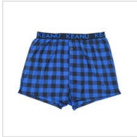
Mens Woven Check Boxer Shorts