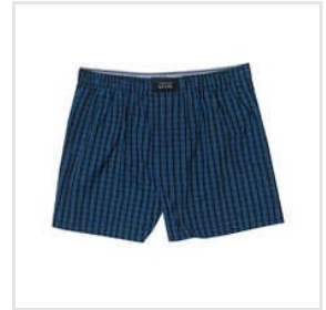
AE Mens Woven Boxer Shorts