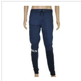
Mens French Terry Joggers