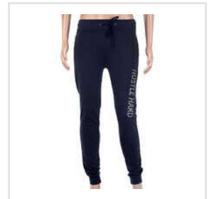
Mens Sports Terry Jogger