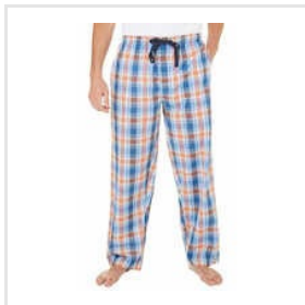
Mens Woven Oversize Night Pant