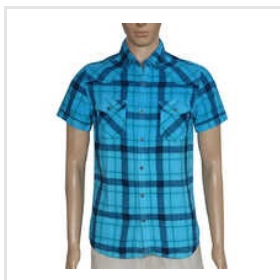
Mens Woven Checked Shirt