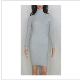
Ladies Viscose Sweater Knit Dress