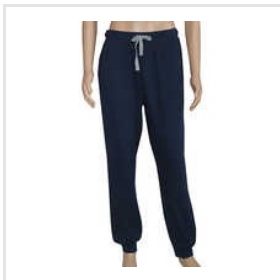
Mens With Ankle Cuff Night Pant