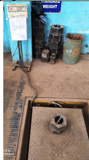
Calibration Checked for Weigh Balance – found in order