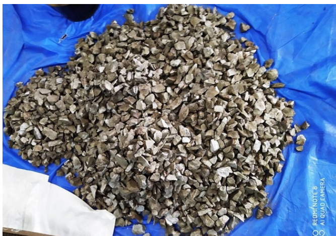
Total material emptied out from all 10 drums