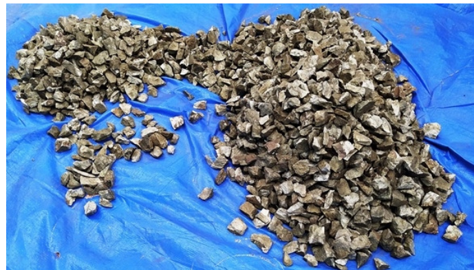
All drums completely emptied on clean and dry tarpauline for inspection