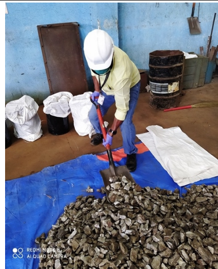
Mixing of total material by making cone is in progress