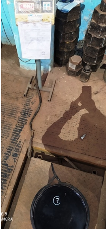
Individual drum checked for Gross wt.