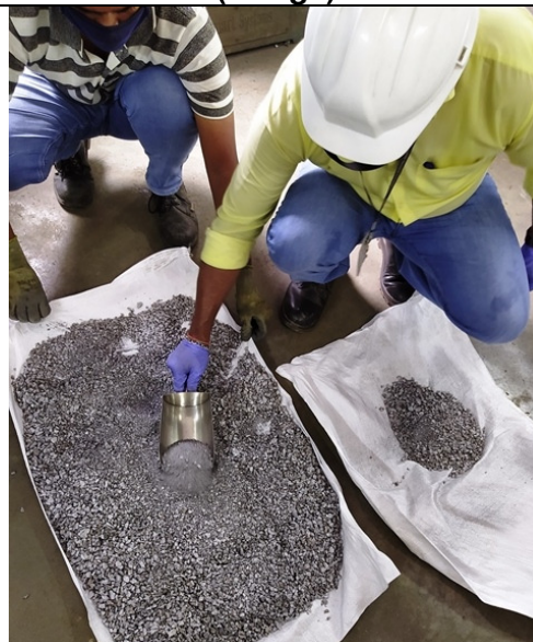
Sample size reduced to 7 kg by I.R. Method (3 stages)