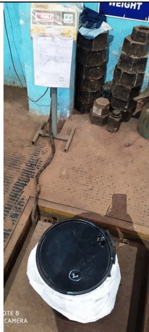
Individual drum checked for Gross wt.