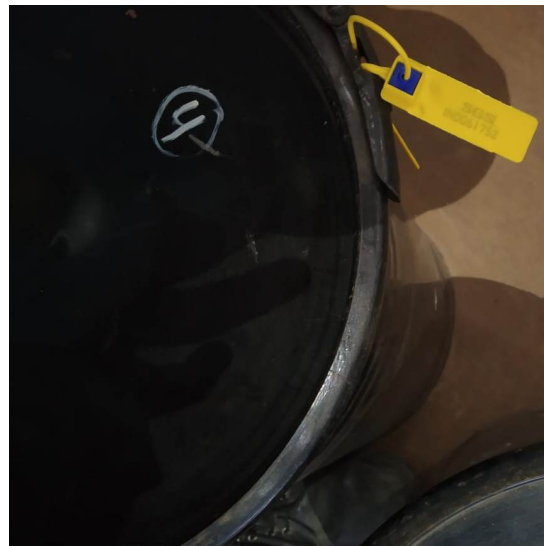
Drums sealed with SGS Numbered plastic wire seal