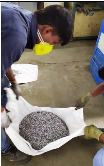
Gross sample mixed properly (-10 MM)