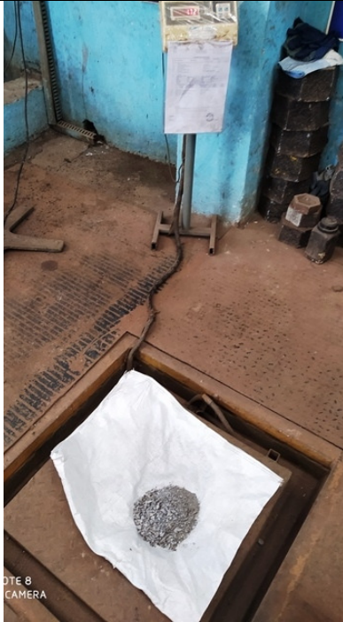
Material passed through 10 MM sieve checked for weight