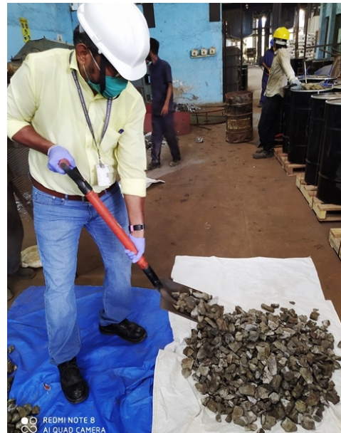
Sample collected for Sieve analysis