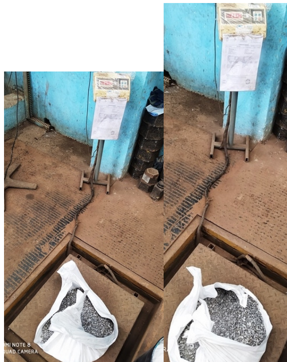
Gross Sample completely crushed to -10 MM (55 kgs)