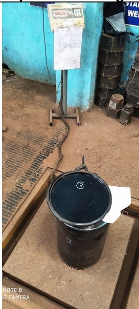
Individual drum checked for Tare wt