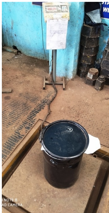
Checked Tare wt of Individual drum