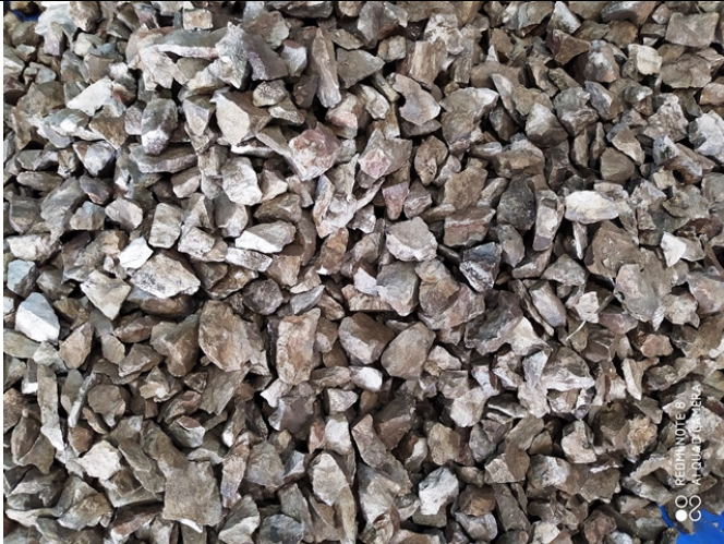
One more close view of material - showing material is free from foreign material & slag contamination