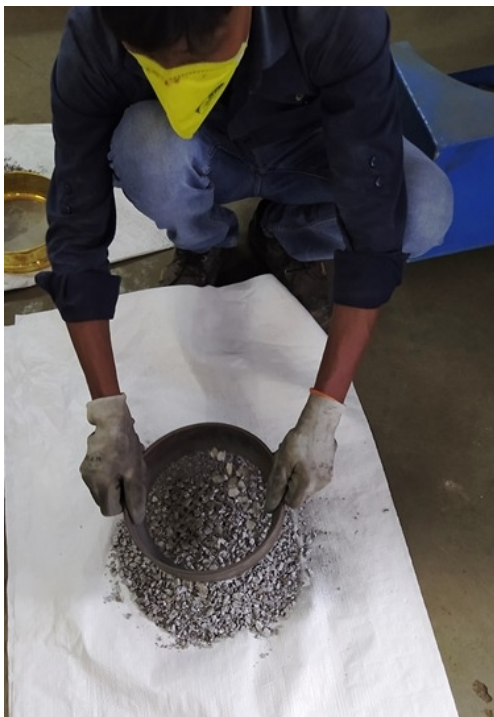
Sample preparation in process