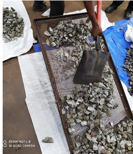
Sieving in progress to check material below 10 MM size in progress