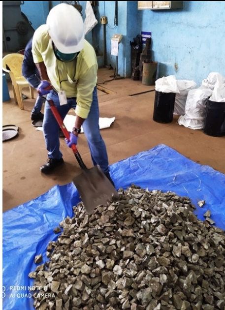
Collection of Sample increment for Chemical analysis & Sieve analysis from the flattened material