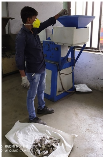
Sample Crushing in progress to get (-)10 MM size