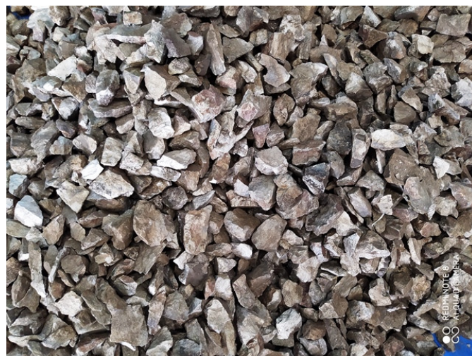
Material observed free from foreign material & slag contamination (close view)