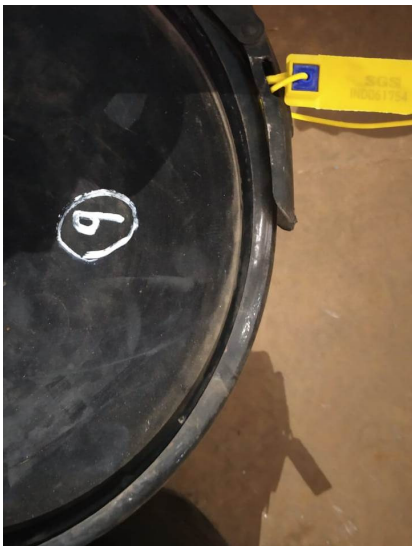
Drums sealed with SGS Numbered plastic wire seal