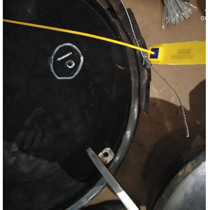
Drums sealed with SGS Numbered plastic wire seal