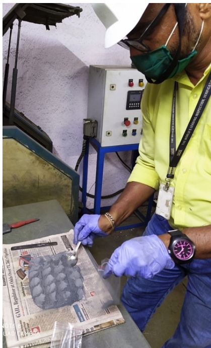
Finally prepared 4 X 100 gm packets