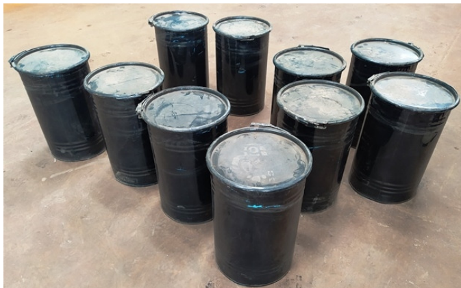
Cargo offered in packed condition in drums