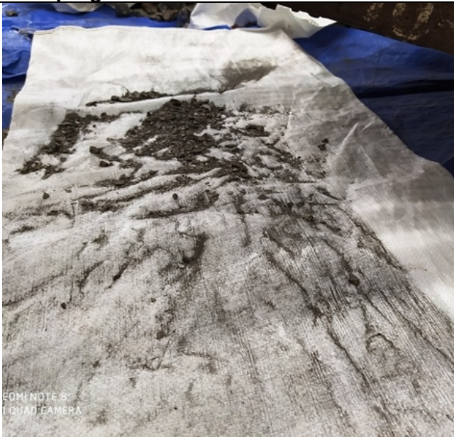
Quantity of total material found below 10 MM Sieve