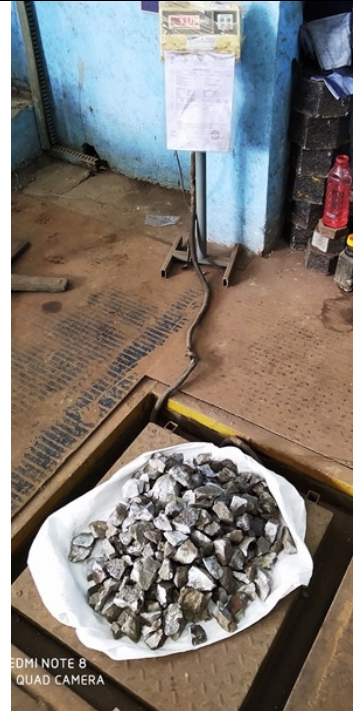
Sample collected for Chemical Analysis