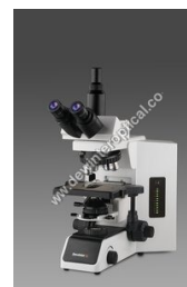
Advanced Fluorescent Microscope