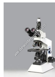
DIGITAL BIOLOGICAL MICROSCOPE