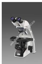
LCD DIGITAL MICROSCOPE