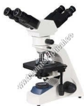
Dual Head Microscope