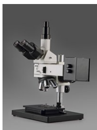
Dark Field Metallurgical