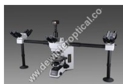
Five Head Teaching Microscope