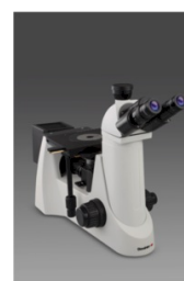
TRINOCULAR INVERTED MICROSCOPE