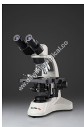
BINOCULAR BIOLOGICAL MICROSCOPE

4K UHD Camera For Microscope, Advanced Fluorescent Microscope, Binocular Biological Microscope, Binocular Stereo Microscope, Cast Iron Analysis Software, Dark Field Metallurgical Microscope, Digital Biological Microscope, Digital Gem Microscope, Digital Microscope, Digital Microscope Camera, etc.