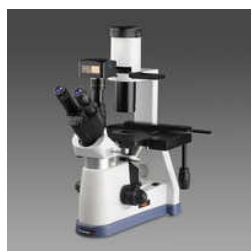
Inverted Tissue Culture Microscope