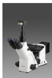
Inverted Metallurgical Microscope