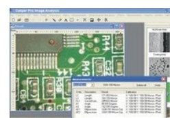
Image Analysis Software- Caliper Pro