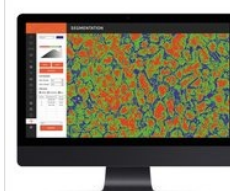
Material Analysis Software