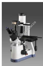
Tissue Culture Microscope