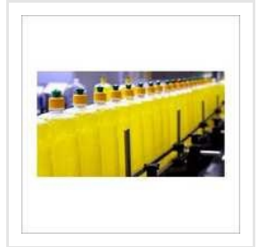
Floor Cleaner Fragrance