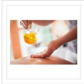
Massage Oil Fragrance