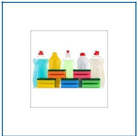
DISHWASH BAR FRAGRANCE