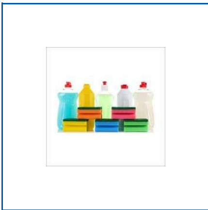
DISHWASH LIQUID FRAGRANCE

After Shave Fragrance, Air Freshener Fragrance, Body Lotion Fragrance, Deodorant Fragrance, Detergent Powder Fragrance, Dishwash Bar Fragrance, Dishwash Liquid Fragrance, Fabric Stain Remover Fragrance, Face Wash Fragrance, Fairness Cream Fragrance, Floor Cleaner Fragrance, Hair Oil Fragrance, Hand Wash Gel Fragrance, Herbal Face Wash Fragrance, Incense Stick Fragrances, etc.