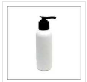
Body Lotion Fragrance