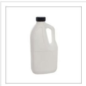
Liquid Detergent Fragrance