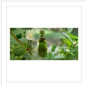
Hair Oil Fragrance