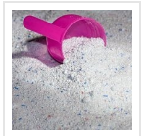
Detergent Powder Fragrance