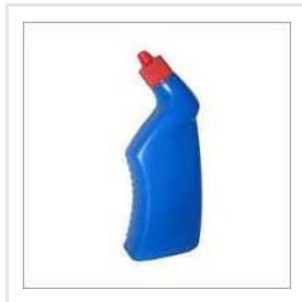
Toilet Cleaner Fragrance