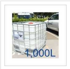
Industrial Cleaning Fragrance