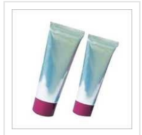
Face Wash Fragrance