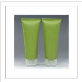
Herbal Face Wash Fragrance