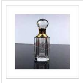
Roll On Attar Fragrance