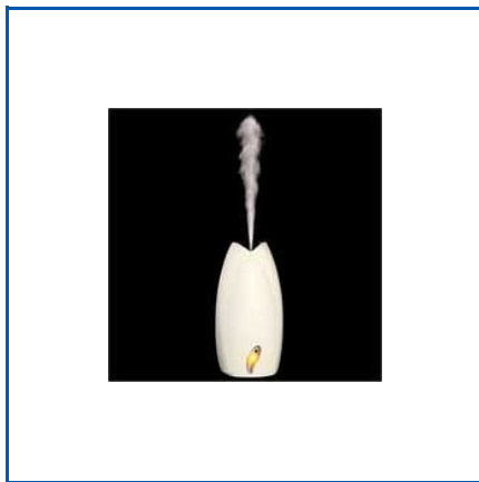
AIR FRESHENER FRAGRANCE