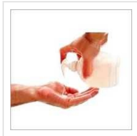
Hand Wash Gel Fragrance