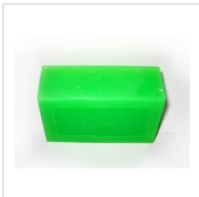
Laundry Soap Fragrance