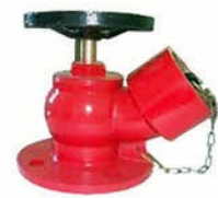
Fire Hydrant Valve