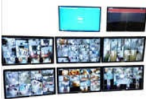
CCTV Control Room