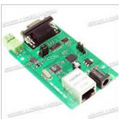
RS232 Converter Card