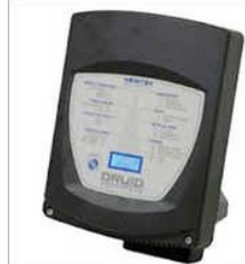
Merlin Dual Zone Energizer