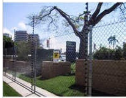
Electric Fencing Mesh Wire