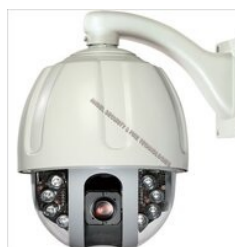
PTZ IP CAMERA