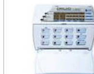
Druid 24 LCD Keypad