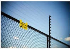
Electric Fencing Wire