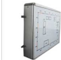
MIMIC Fire Panel