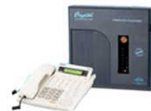
CRYSTAL EPABX SYSTEM