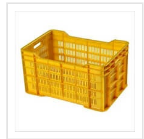
40KG HDPE Crates