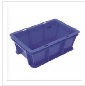
15KG HDPE Crates