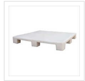
Roto Molded 4 Way Pallets