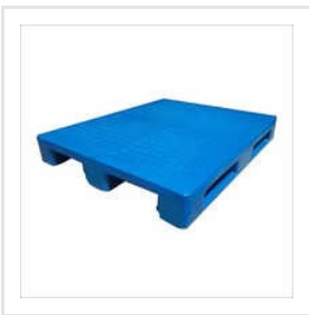
Roto Molded Polyethylene Pallet