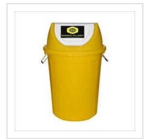
Swing Lid Dustbin