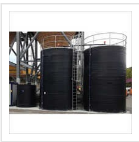
Spiral HDPE Tank