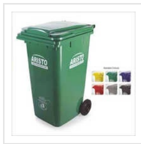
120 LTR Wheel Waste Bin