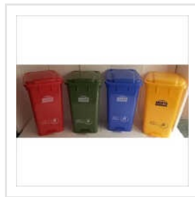
Biomedical Waste Bin