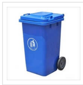
240 LTR Wheeled Waste Bin