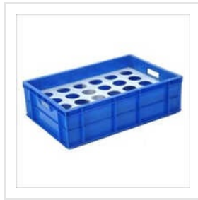
Fabricated HDPE Crates