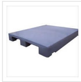
Plain Top Roto Molded Polyethylene Pallet