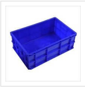
Rectangular HDPE Crates