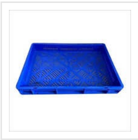
Blue HDPE Crates