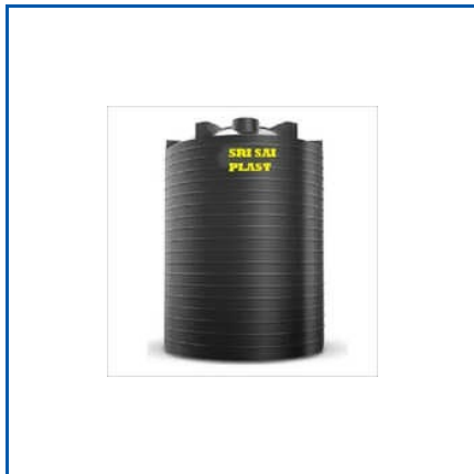
CHEMICAL STORAGE TANKS