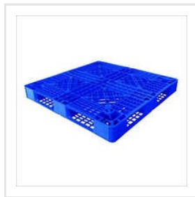
Plastic Export Pallet