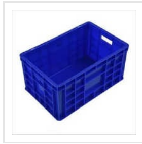
Industrial HDPE Crates