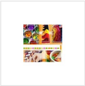
Speciality Paper Chemicals