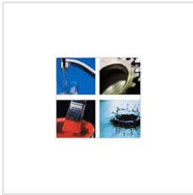
Speciality Process & Functional Chemical