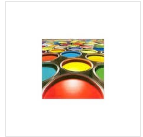
Charge Dissipation Agent