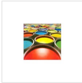
Base Tinter Compatibiliser