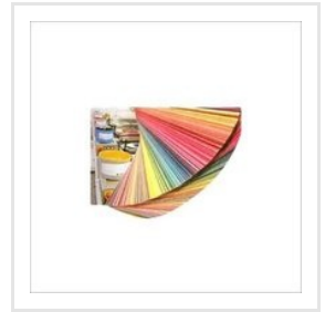
Printing Ink Additives