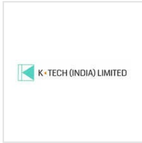
Powder Corrosion Inhibitors