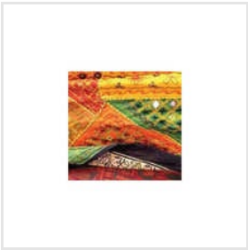
Speciality Textile Chemicals