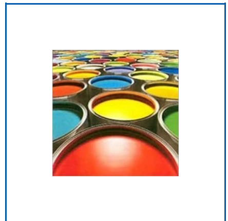
PAINTS & COATING ADDITIVES