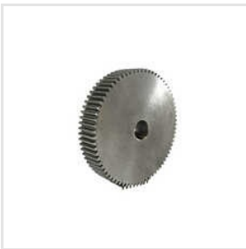
Stainless Steel Gear Rack