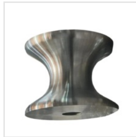
Stainless Steel Forming Roller