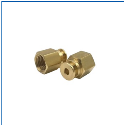
PRECISION BRASS TURNED PARTS