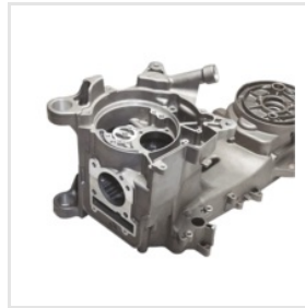
Prototype Casting Components