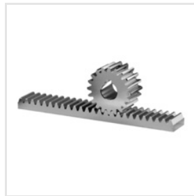
Rack Pinion Gear