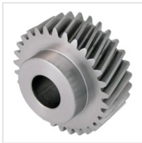
Double Helical Gear