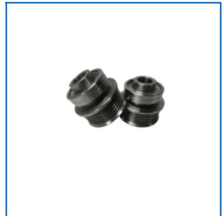
CNC TURNED COMPONENTS