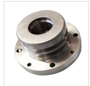
Aluminum Machine Components