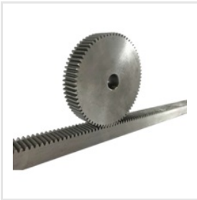
Gear Rack With Gear Pinion