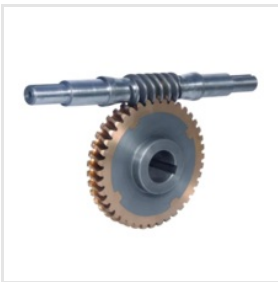
Worm And Worm Wheel