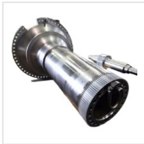
Automotive Spur Gear