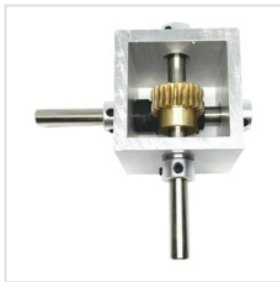
Worm Reduction Gears