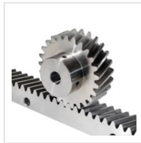
Steel Gear Rack