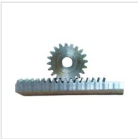
Rack And Pinion Gear