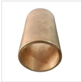
Aluminium Bronze Bushes