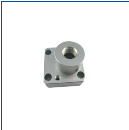
VMC MACHINED COMPONENTS

100 MM Stainless Steel Shafts, 140 MM Mild Steel Shaft, 25 MM Stainless Steel Lead Screw, 304 Stainless Steel Ball, 50 MM Stainless Steel Shaft, Acme Lead Screw, Alloy Steel Forged Bolt, Alloy Steel Lead Screw, Alloy Steel Worm Gear, Aluminium Bronze Bushes, Aluminum Conveyor Roller, Aluminum Machine Components, Anchor Foundation Bolt, Automotive Spur Gear, Bronze Worm Gear, etc.