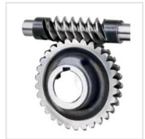
Alloy Steel Worm Gear