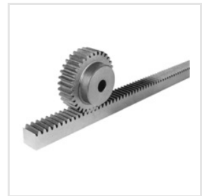
SS Gear Rack