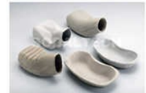
Kidney Tray And Bowl