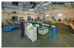
Paper Core Winder