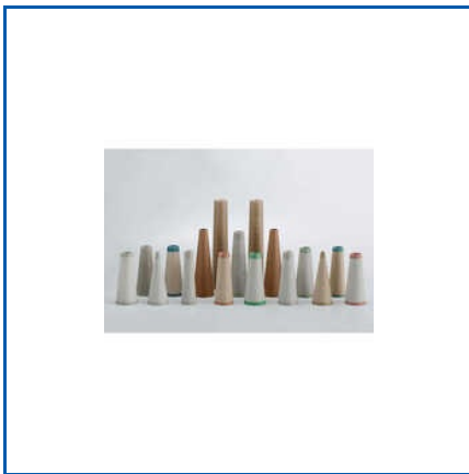
TEXTILE PAPER CONES

Agriculture Seed and PlantsPots, Automatic Core Cutter EC Series, Automatic Core Cutter SARC Series, Automatic Disposable Sugarcane Bagasse Pulp Thermoforming Machine, Automatic Paper Cone Finishing Machine (Twin Index), Automatic Paper Cone Making Machine with Online Drier, Automatic Paper Tube Finishing Machine, Bottle Packs, Cardboard Paper Tube, Composite Can Body Maker, Composite Can Making Machine, Composite Cans, Conical Bolt Boxes, Corner Protector Machine, Cup Carries, etc.