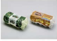
Egg Carton Box