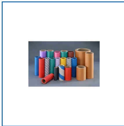
PAPER TUBES AND CORES