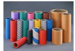
Cardboard Paper Tube