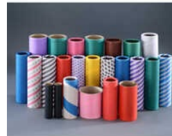
Packaging Paper Tube