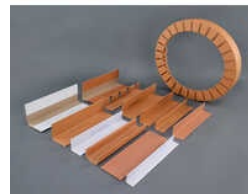
Paper Edge Protectors