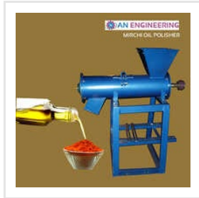
Mirchi Oil Polisher Machine