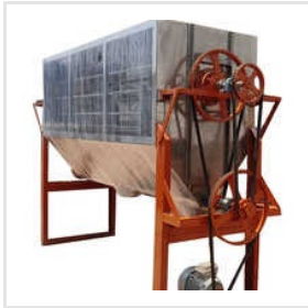
Turmeric Dressing Machine