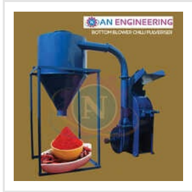
Chilli Bottom Blower Pulveriser