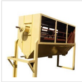
Mild Steel Dressing Machine