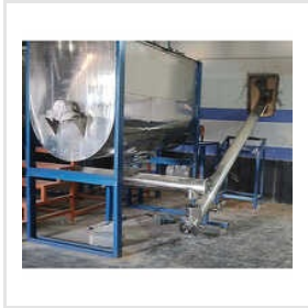
Industrial Ribbon Blender Mixer Plant