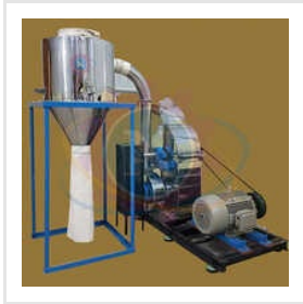
Heavy Duty Bottom Blower Pulveriser