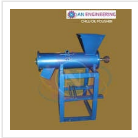
Chilli Oil Polisher Machine