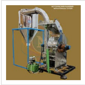
Bottom Blower Pulveriser With