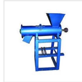
Heavy Duty Oil Polisher Machine