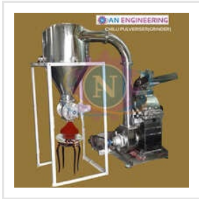
Industrial Chilli Grinder Pulveriser