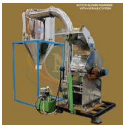
BOTTOM BLOWER PULVERISER WITH HYDRAULIC SYSTEM

Bottom Blower Pulveriser With Hydraulic System, Chilli Bottom Blower Pulveriser, Chilli Oil Polisher Machine, Heavy Duty Bottom Blower Pulveriser, Heavy Duty Oil Polisher Machine, Industrial Chilli Grinder Pulveriser, Industrial Ribbon Blender Mixer Plant, Mild Steel Dressing Machine, Mild Steel Ribbon Blender Mixer, Mirchi Oil Polisher Machine, Turmeric Dressing Machine, etc.