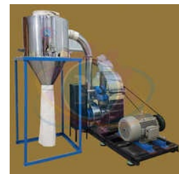
HEAVY DUTY BOTTOM BLOWER PULVERISER