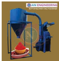
CHILLI BOTTOM BLOWER PULVERISER