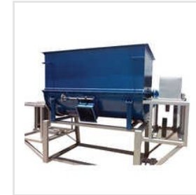
Mild Steel Ribbon Blender Mixer