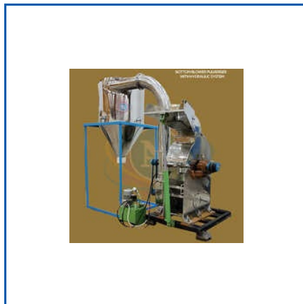
BOTTOM BLOWER PULVERISER WITH HYDRAULIC SYSTEM