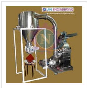
Industrial Chilli Grinder Pulveriser