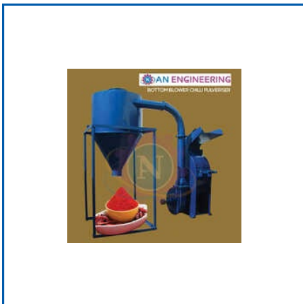
CHILLI BOTTOM BLOWER PULVERISER

Automatic Chilli Cleaning And Grinding Plant, Bottom Blower Pulveriser, Bottom Blower Pulveriser With Hydraulic System, Bottom Discharge Machine, Chilli Bottom Blower Pulveriser, Chilli Cleaning Plant, Chilli Oil Polisher, Chilli Oil Polisher Machine, Cone Type Pulveriser, Elbow Type Pulveriser, Handa Screw Conveyor, Heavy Duty Bottom Blower Pulveriser, Heavy Duty Oil Polisher Machine, Industrial Chilli Grinder Pulveriser, Industrial Ribbon Blender Mixer Plant, etc.