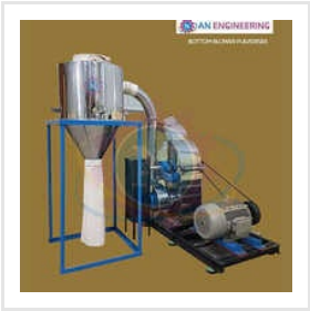
Bottom Blower Pulveriser