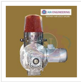
Rotary Air Lock Valve