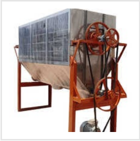
Turmeric Dressing Machine