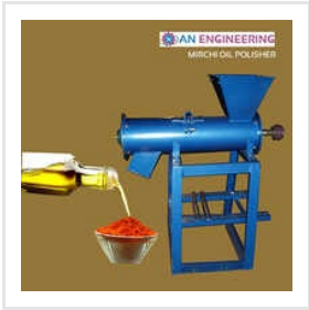
Mirchi Oil Polisher Machine