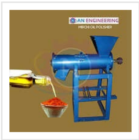
Chilli Oil Polisher