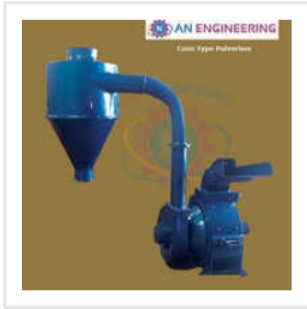
Cone Type Pulveriser