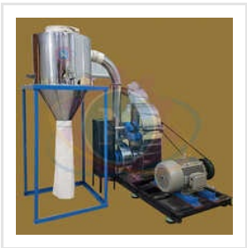
Heavy Duty Bottom Blower Pulveriser