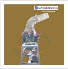
Bottom Discharge Machine