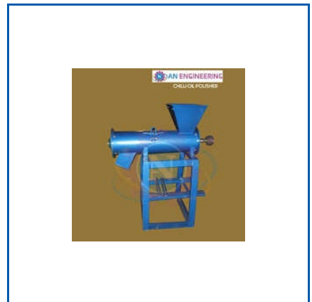
CHILLI OIL POLISHER MACHINE