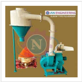
Elbow Type Pulveriser