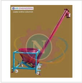
Handa Screw Conveyor