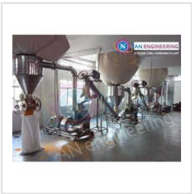
Automatic Chilli Cleaning And Grinding