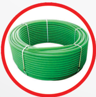
CABLE DUCT PIPES