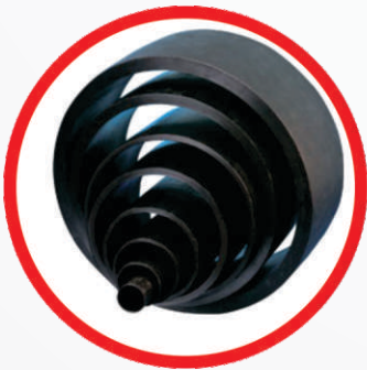
HDPE PIPES AND COIL