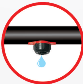
DRIP IRRIGATION SYSTEMS