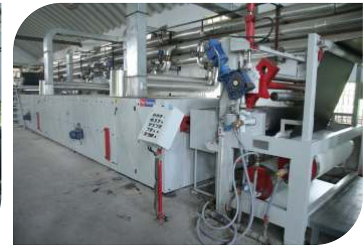
PLCs/HMIs control panels with AC Servo Drives / SCADA Systems