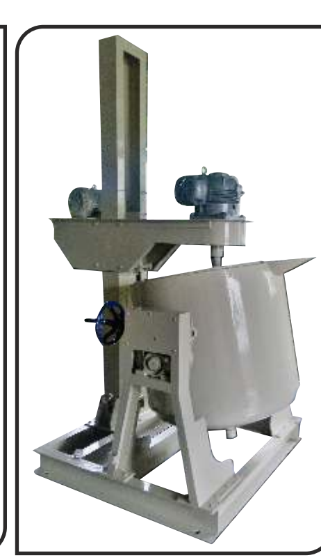
gum cooking pan with high speed stirrer