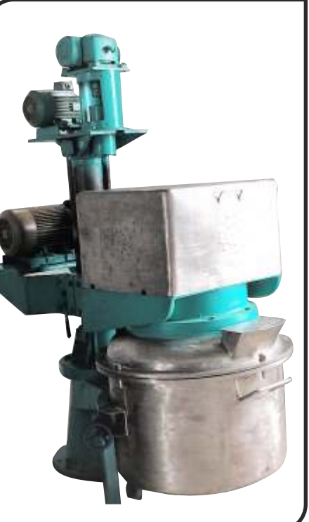
pl anetary mixer