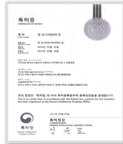
Patent for Music Pang