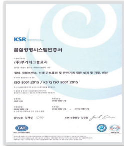
ISO 9001 Certificate of quality management system

Value added technology co., Ltd. was founded in 1998. Since the production of EMI NOISE FILTER, we have been in R & D and investment for 17 years. With the aim of achieving the highest quality, we are continuing soundgrowth. We will do our best to satisfy our customers' needs by keeping focus on R&D.