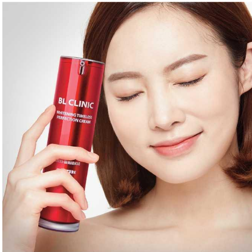
BL Clinic Whitening Timeless Perfection Cream

“Enjoy Whitening Clinic Within A Second in Busy Morning”