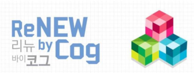
Trade mark(No. 40-1150740)