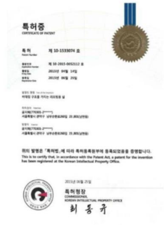
Patent Registration (No. 10-1533074)