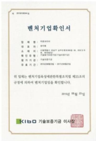
Venture Company (No. 20150106344)