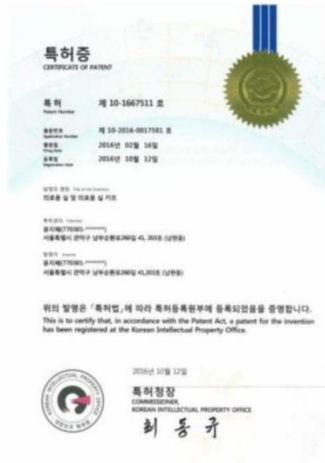
Patent Registration (No. 10-1667511)