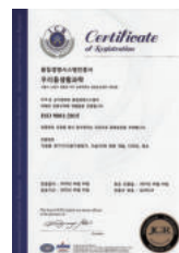
ISO 9001 Certificate