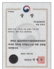
Awarded in the Korea Invention Patent Exhibition