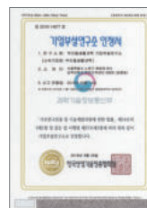
Business-Affiliated R&D Center Certificate